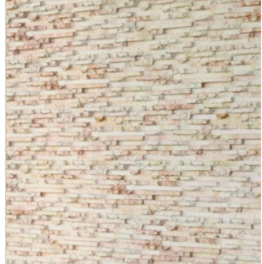
3D Stone Sand NB17545 170x520x12mm