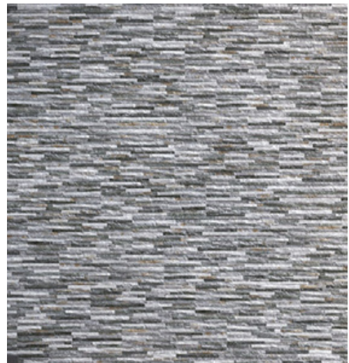
3D Stone Grey NB17547 170x520x12mm