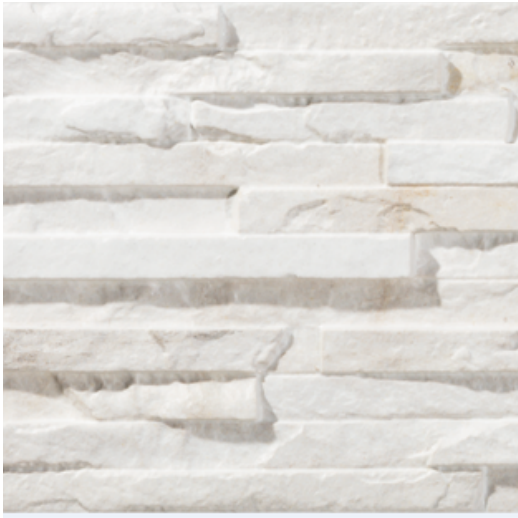
3D Stone White