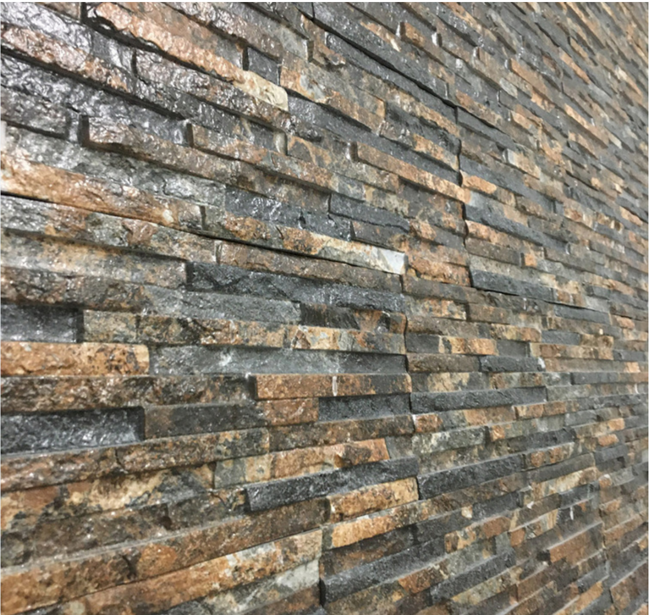
3D Stone Magma

Natural stone effect split black tiles transform any space. The decadent feature wall is available in a series of natural tone.