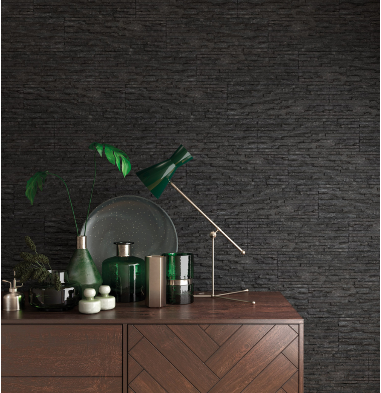
3D Stone Black