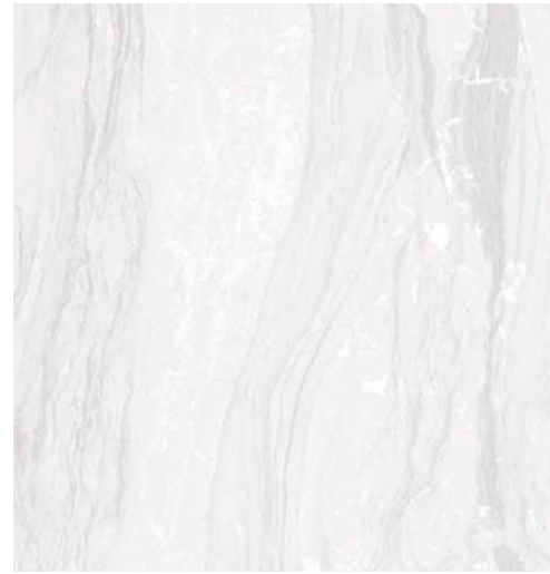
Concept Beige Natural