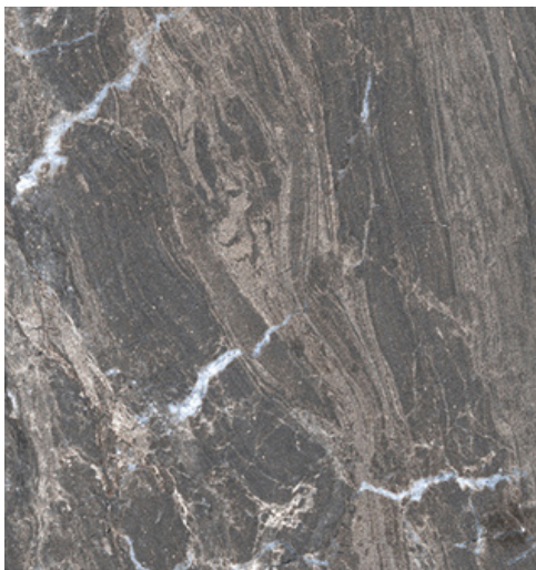
Concept Light Grey Natural