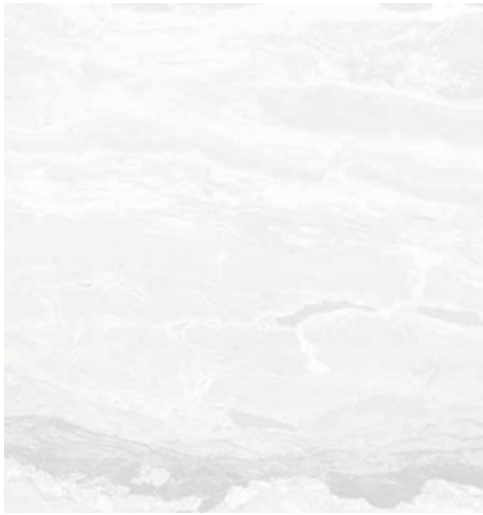
Concept White Natural

Produced in coloured paste porcelain stoneware, this collection is inspired in limestone, a very elegant and soft stone. Interpreted in porcelain, Concept presents a great resistance, which offers new possibilities and uses. In order to turn this collection more realistic, it was developed a mica effect, which can also be found in the original stone.