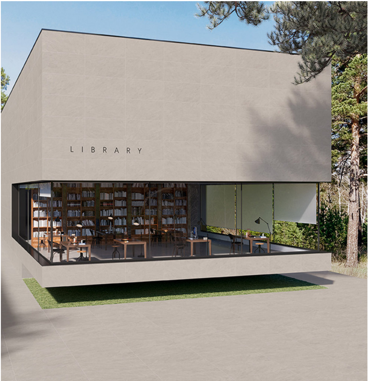
Concept Light Grey