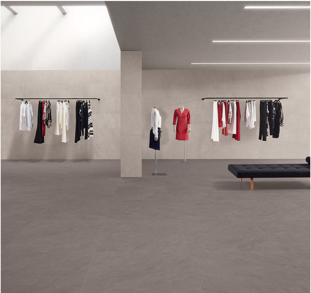
Concept Grey Natural, Concept Light Grey Natural

Produced in coloured paste porcelain stoneware, this collection is inspired in limestone, a very elegant and soft stone. Interpreted in porcelain, Concept presents a great resistance, which offers new possibilities and uses. In order to turn this collection more realistic, it was developed a mica effect, which can also be found in the original stone.