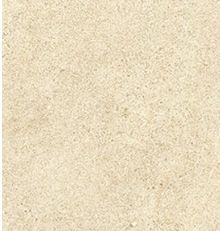
Hybrid White Natural