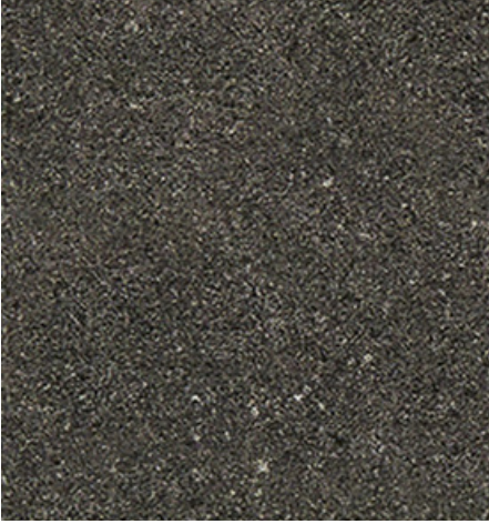
Hybrid Black Natural