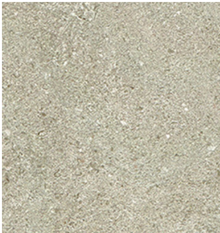
Hybrid Light Grey Natural