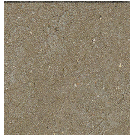
Hybrid Tortora Natural