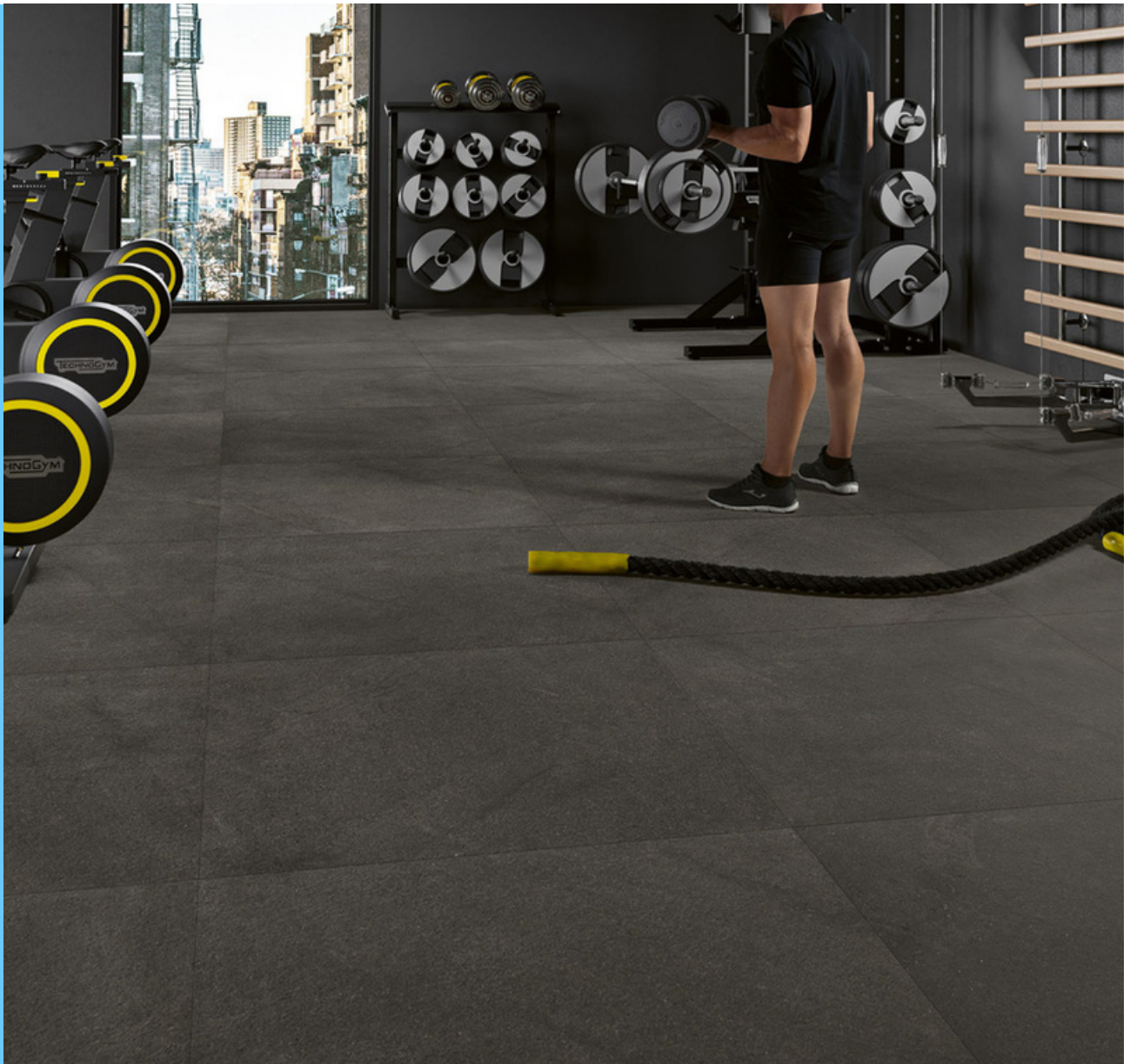
Hybrid Black Natural

Hybrid is a remarkable example of porcelain stoneware that uses Dual Tech technology, capable of adding an unmatched graphic richness and a controlled application of colours. The technical component of this collection makes it the perfect choice for large spaces, which not only require large dimensions, but aesthetically help to create more elegant and impressive environments.