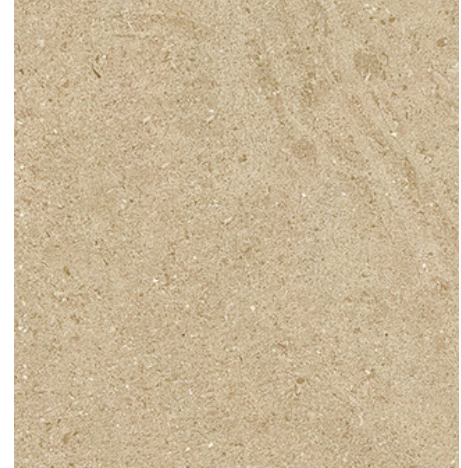
Hybrid Beige Natural