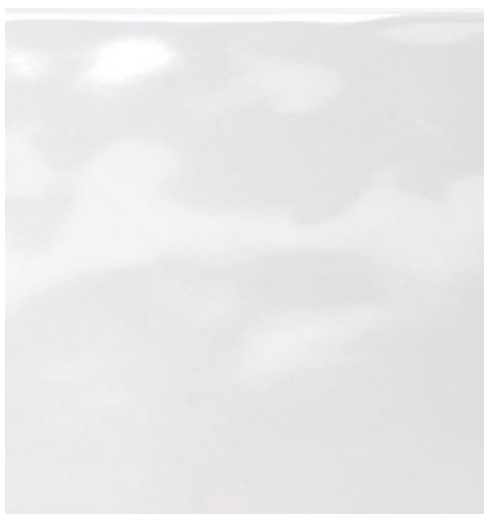
Whites Bumpy Gloss