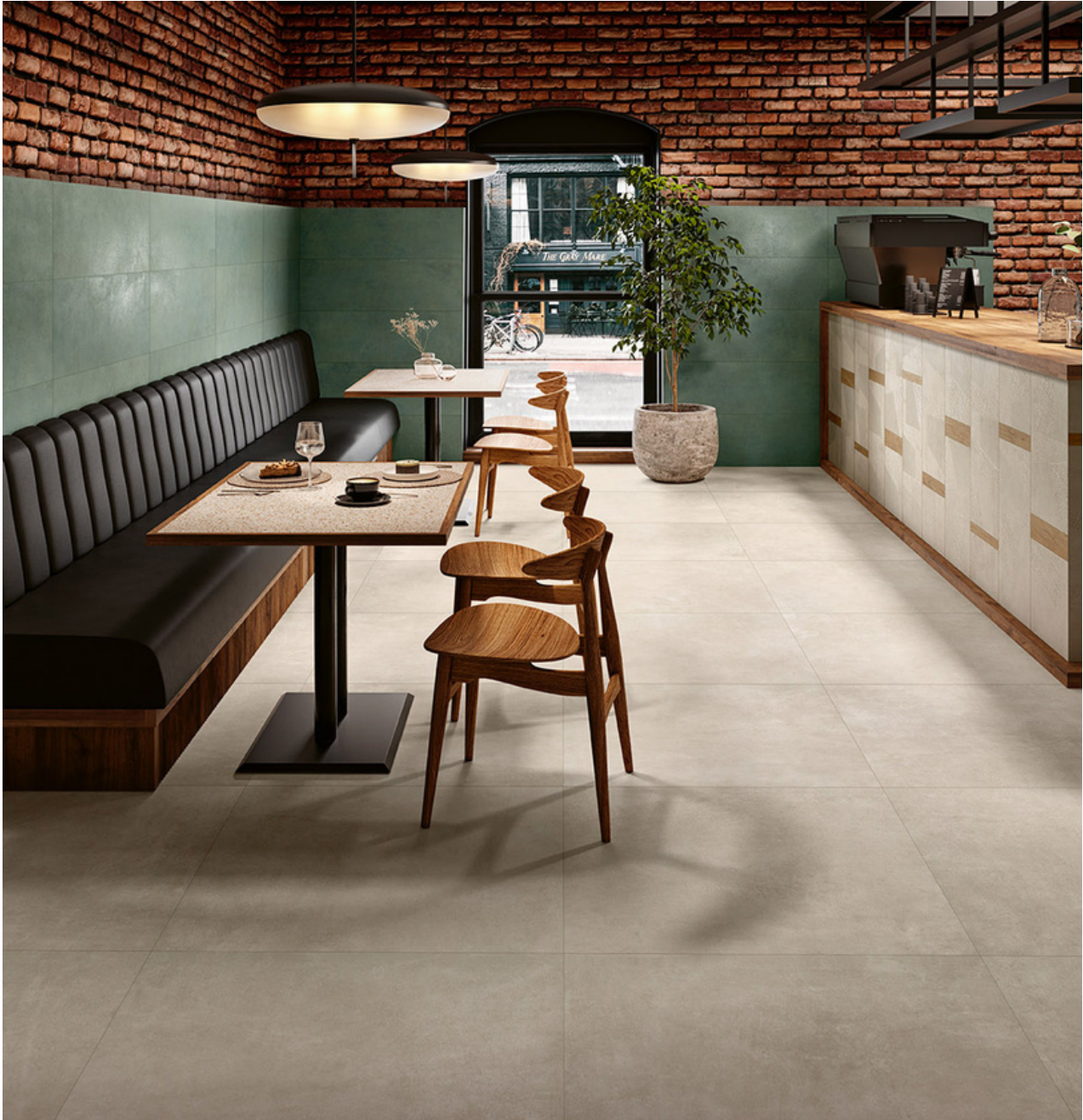
Tropic Grey & Tropic Green