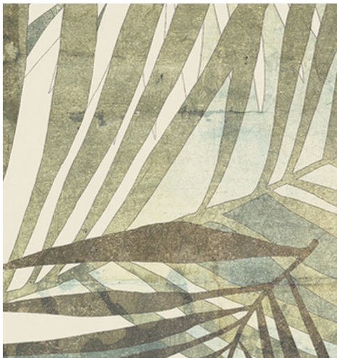
Tropic Exotic Decor