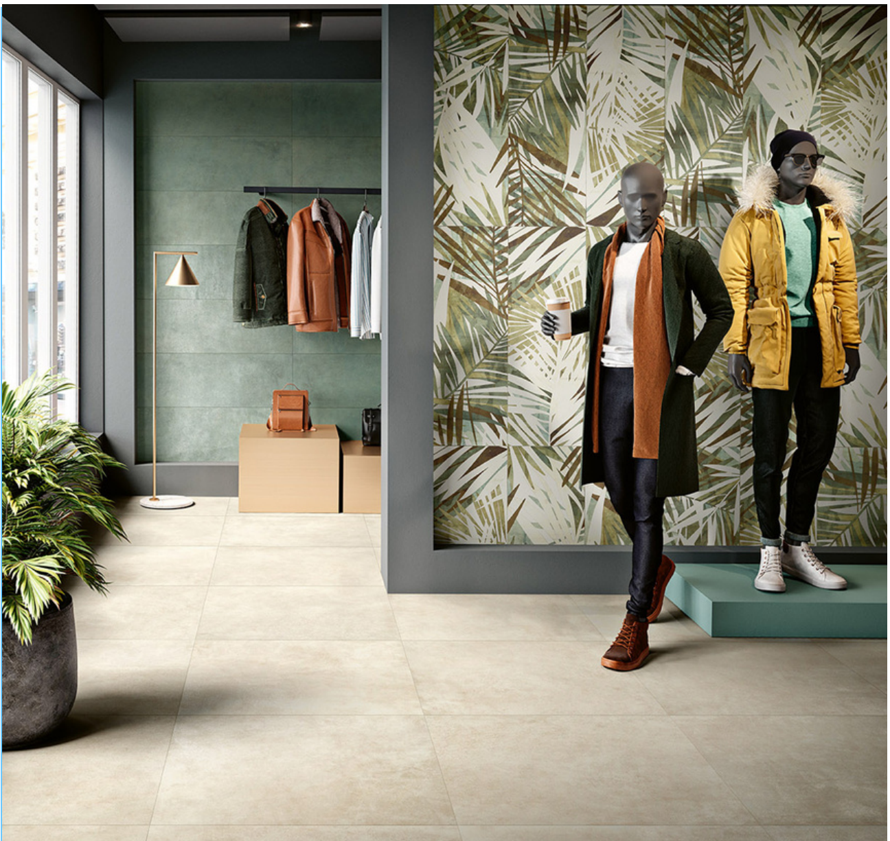
Tropic Green & Tropic White & Tropic Exotic Decor

Captivating, the surface of the collection has slight oxidised contrasts, that along with the on-trend décor add volume, liveliness and charisma to interior spaces.