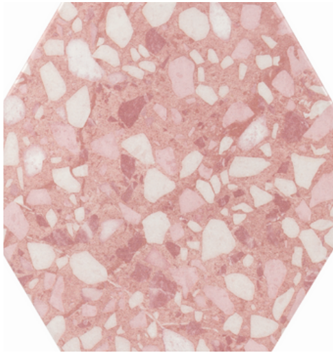
Terrazzo Hexagon Rose

Terrazzo Hexagon embodies mixed stone and cement within a hexagon format to create a popular, contemporary look.