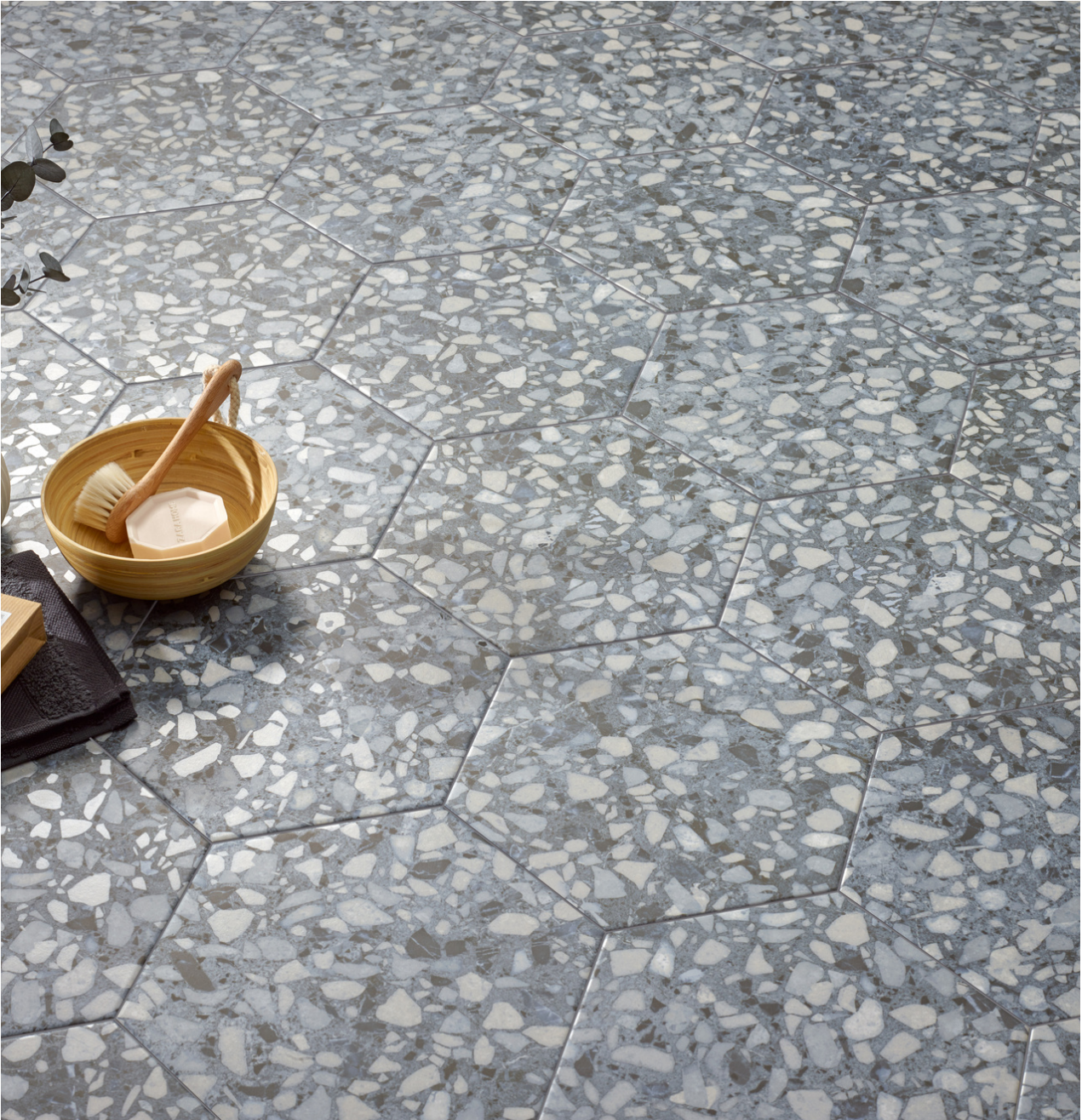
Terrazzo Hexagon Blue