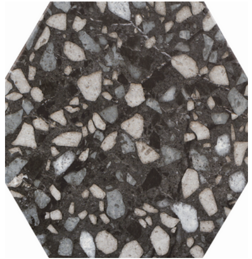
Terrazzo Hexagon Black