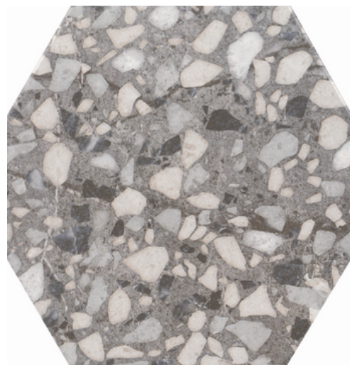
Terrazzo Hexagon Grey