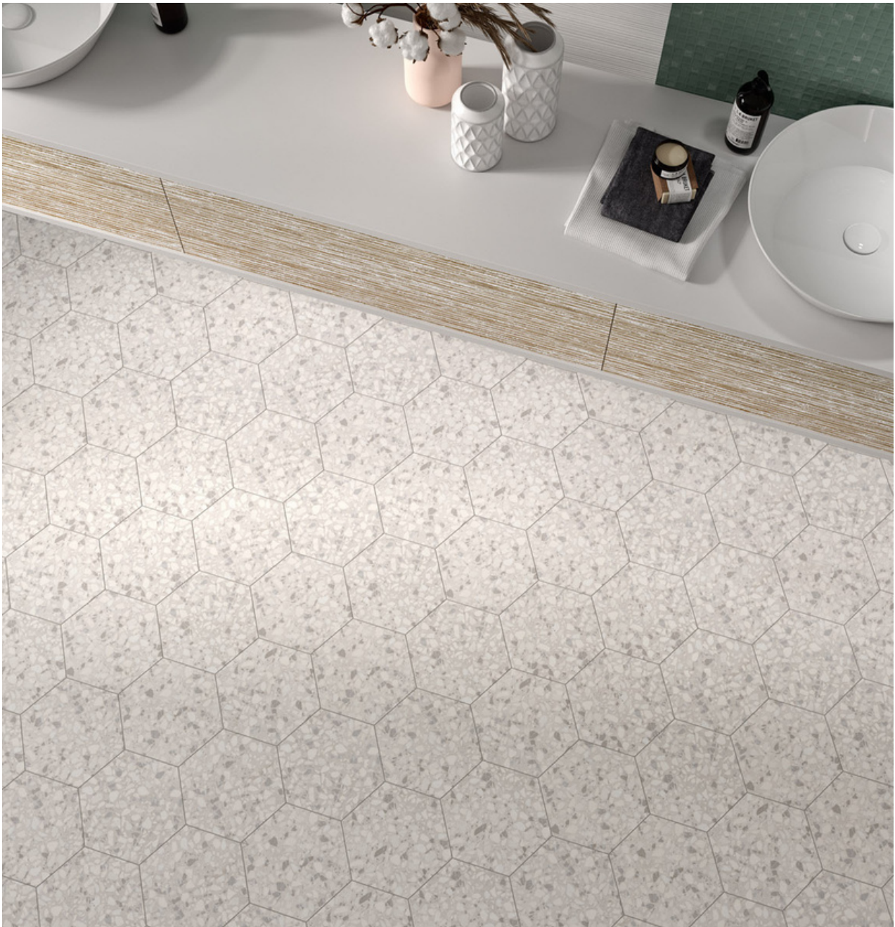
Terrazzo Hexagon White