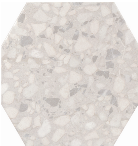
Terrazzo Hexagon White

Terrazzo Hexagon embodies mixed stone and cement within a hexagon format to create a popular, contemporary look.