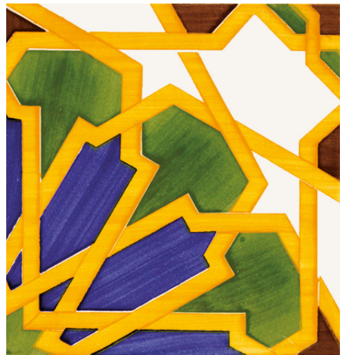
Moorish Hand Painted Marrakesh