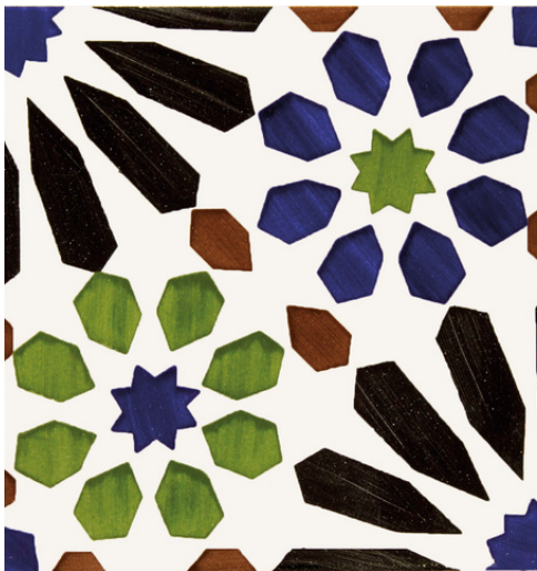
Moorish Hand Painted Casablanca