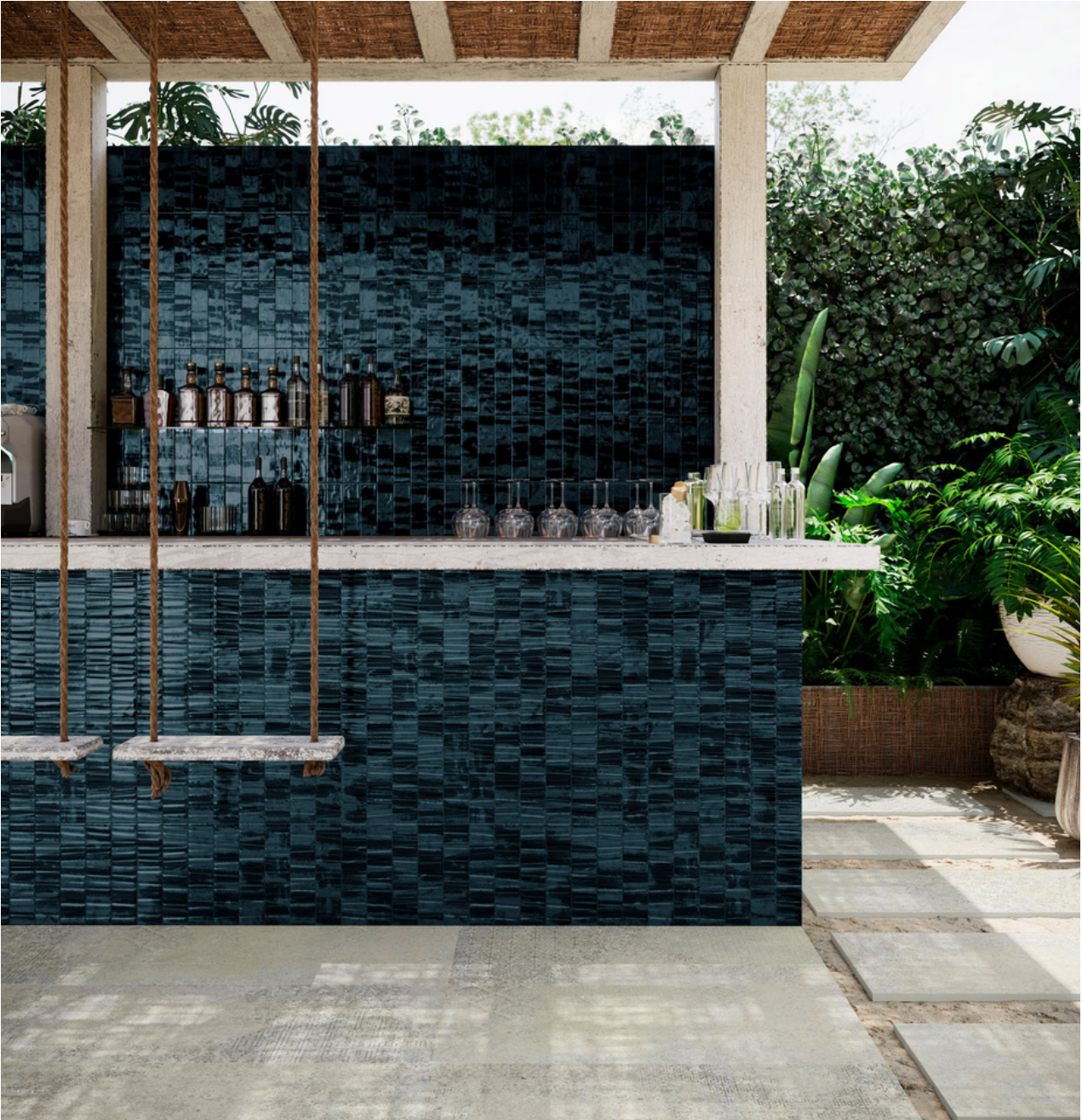
Langham Sapphire Blue Decor