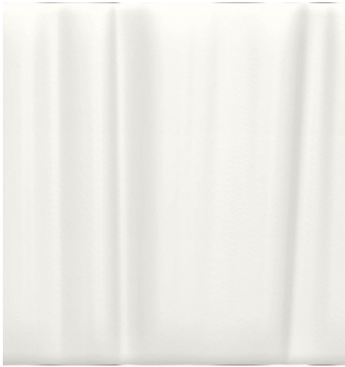
Langham White Decor

The rich on-trend palette, indulgent gloss and the highly structured surface décor elevates the look of any interior wall space.