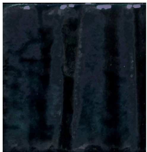
Langham Sapphire Blue Decor