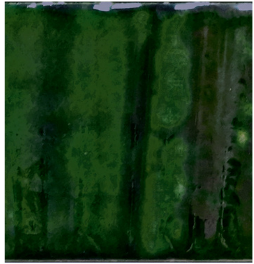
Langham Jade Green Decor