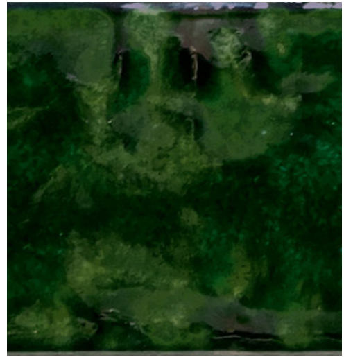
Langham Jade Green