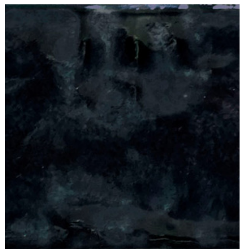
Langham Sapphire Blue