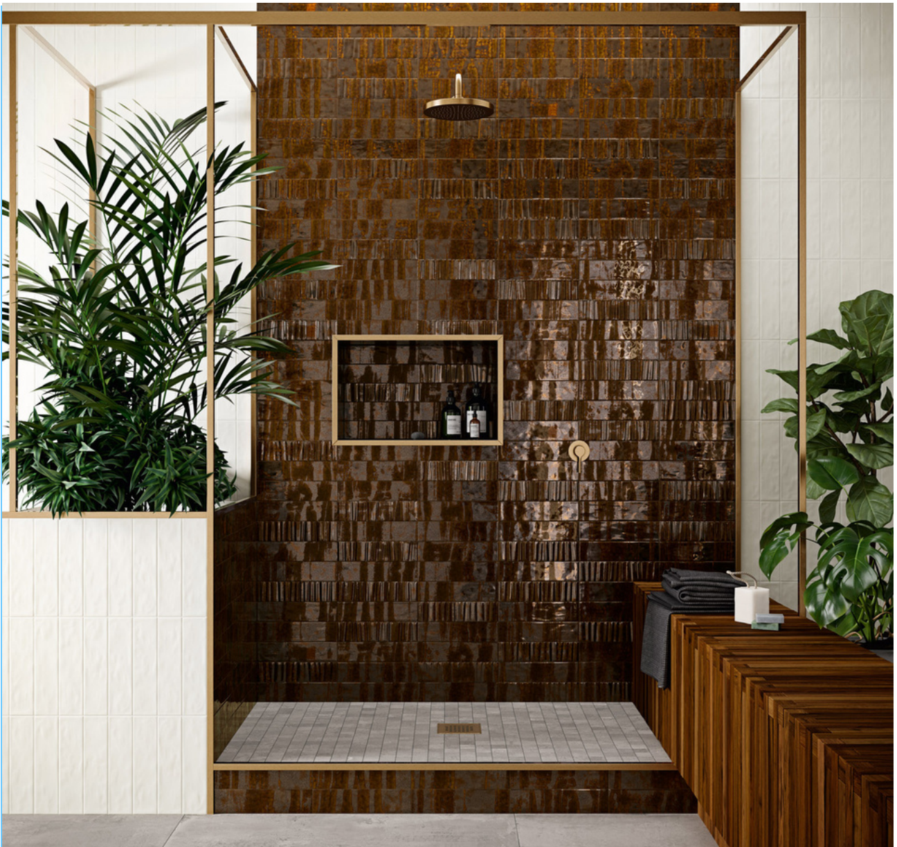
Langham Toffee Brown Decor

The rich on-trend palette, indulgent gloss and the highly structured surface décor elevates the look of any interior wall space.