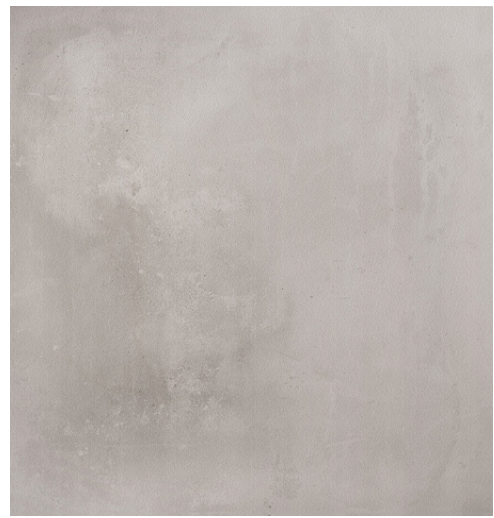
Tool Light Grey NCS188932 600x600x20mm