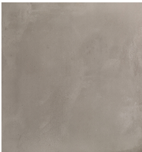
Tool Tortora NCS188934 600x600x20mm