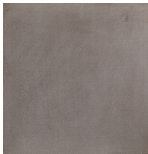
Tool Grey NCS188935 600x600x20mm