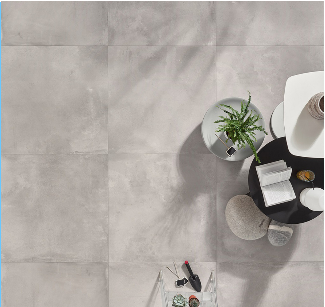
Tool Light Grey

Its graphic is that of a cement where the effect of salts is glimpsed in matt/gloss reflections. A versatile timeless surface that conciliates aesthetics with the advantages of a coloured porcelain stoneware paste.