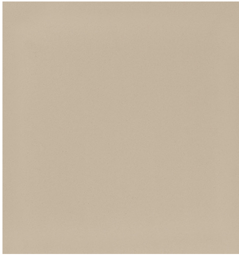
Tecnica Natura Natural

Tecnica series was created for an architectural board to decorate public and private building, guaranteeing exceptional performances and allowing designers to create infinite options, choosing from the various formats, colours and special pieces.