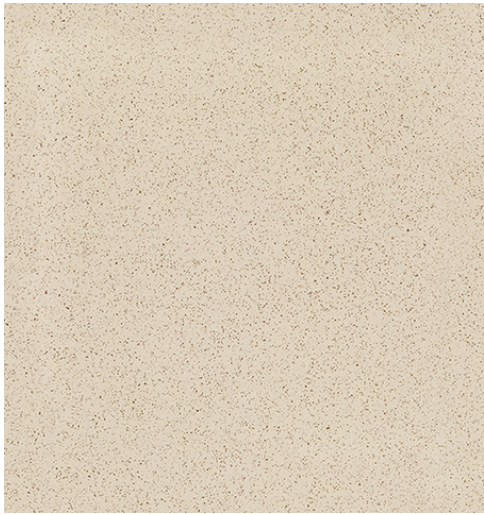
Tecnica Branco Dotty Natural

Tecnica series was created for an architectural board to decorate public and private building, guaranteeing exceptional performances and allowing designers to create infinite options, choosing from the various formats, colours and special pieces.