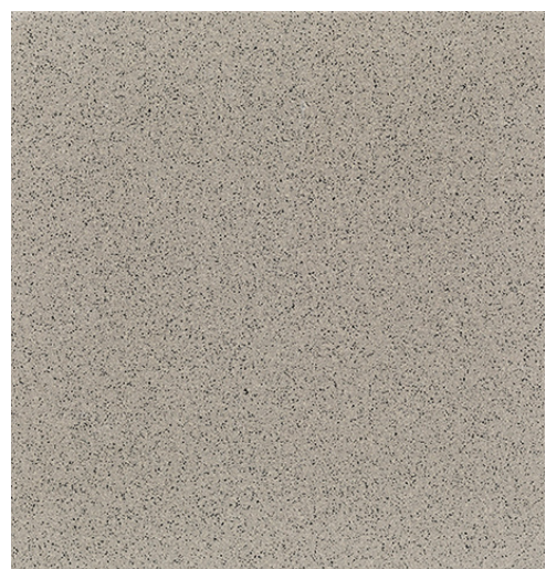
Tecnica Platina Natural

NCS188886 300x300x8.5mm NCS188887 300x300x12mm