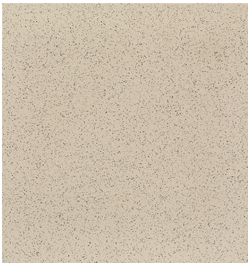
Tecnica Granito Preto Natural

NCS188891 300x300x8.5mm NCS188892 300x300x12mm