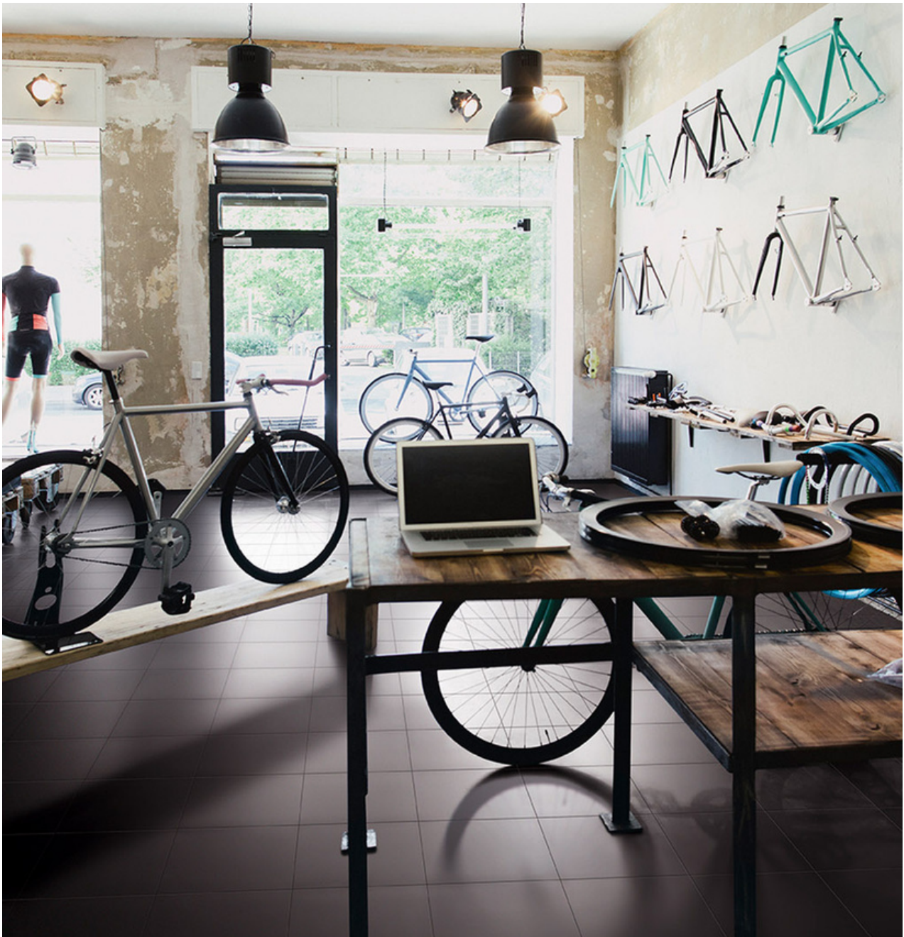
Tecnica Preto Natural