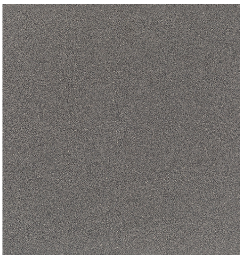
Tecnica Granito Cinza Natural