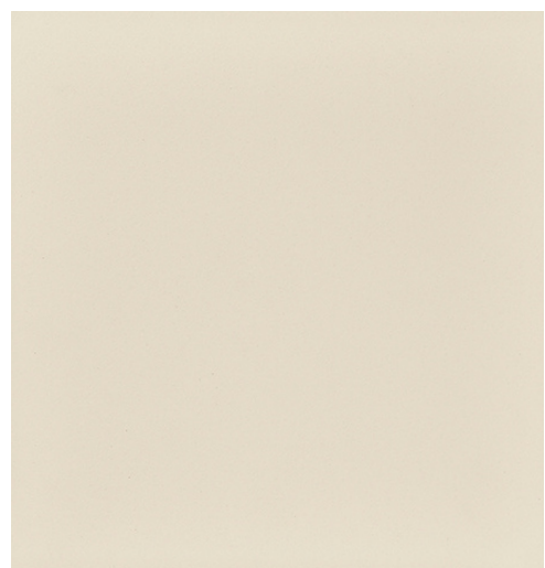
Tecnica Branco Natural

NCS188881 300x300x8.5mm NCS188882 300x300x12mm