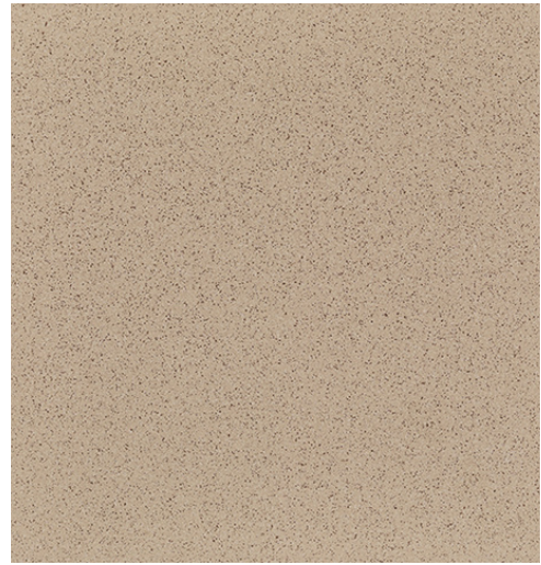
Tecnica Granito Beige Natural