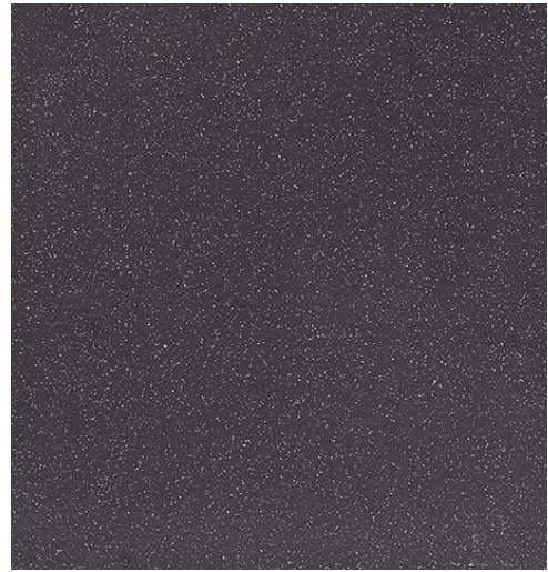
Tecnica Preto Dotty Natural

NCS188888 300x300x8.5mm NCS188889 300x300x12mm