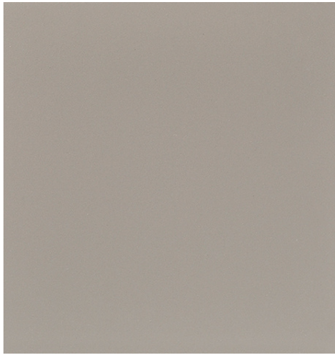
Tecnica Cinza Claro Natural

Tecnica series was created for an architectural board to decorate public and private building, guaranteeing exceptional performances and allowing designers to create infinite options, choosing from the various formats, colours and special pieces.