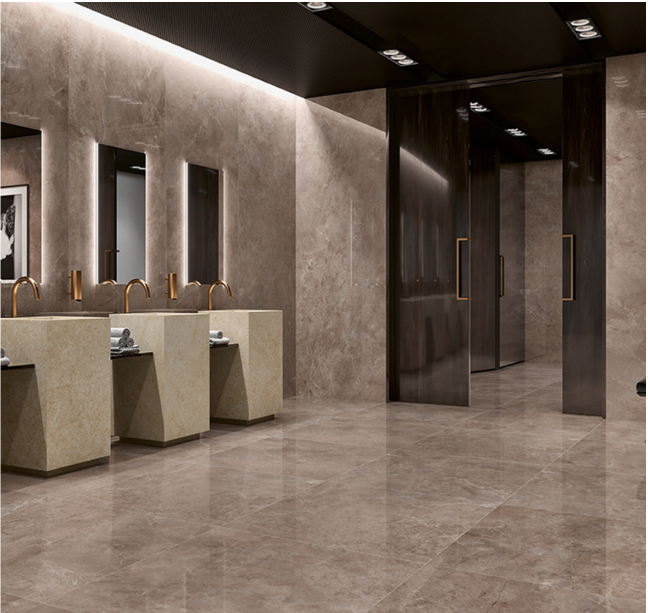
Prestige Fior Di Bosco Tortora Polished

Prestige, an authentic force of nature, eternal in nobility and sophistication, is the true calling for modern Architecture.