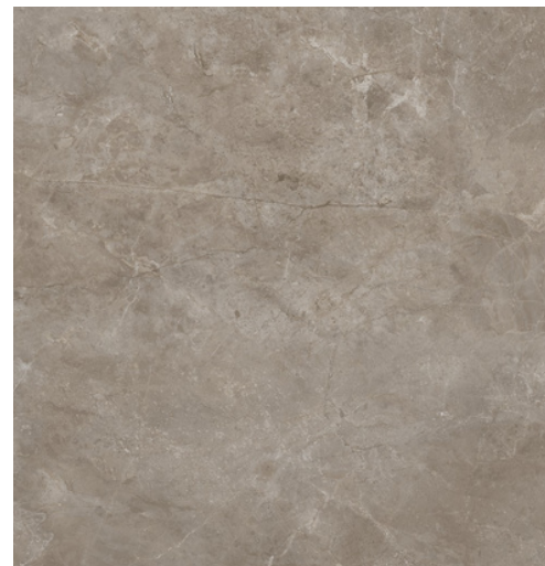
Prestige Linea Fior Di Bosco Tortora Polished