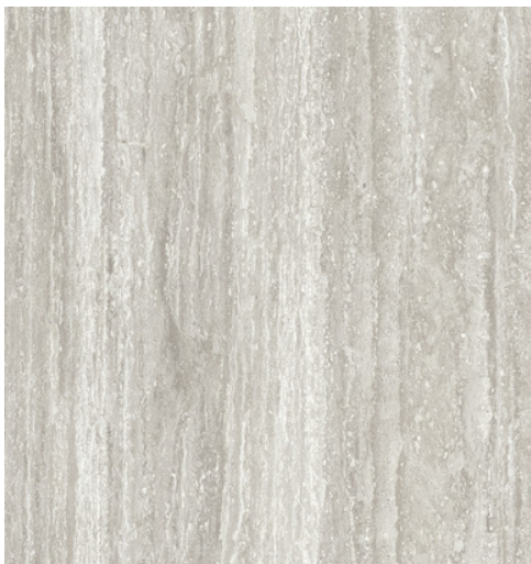
Prestige Linea Travertino Grey Polished