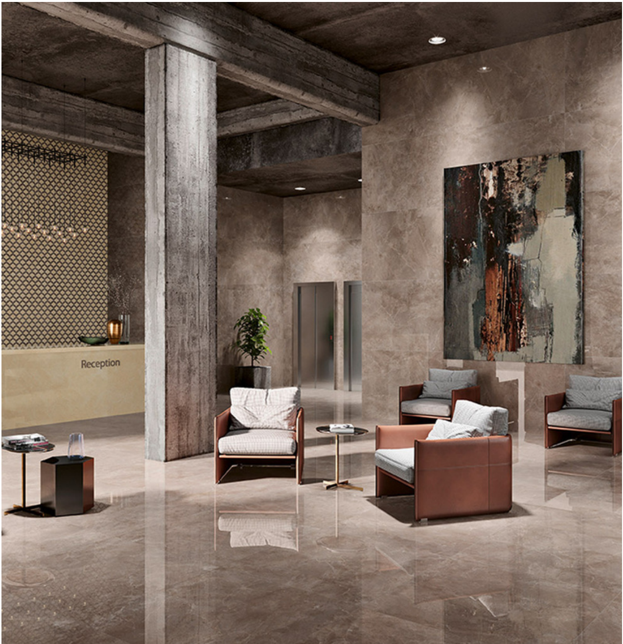
Prestige Fior Di Bosco Tortora Polished