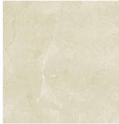
Prestige Linea Corinthian Beige Polished