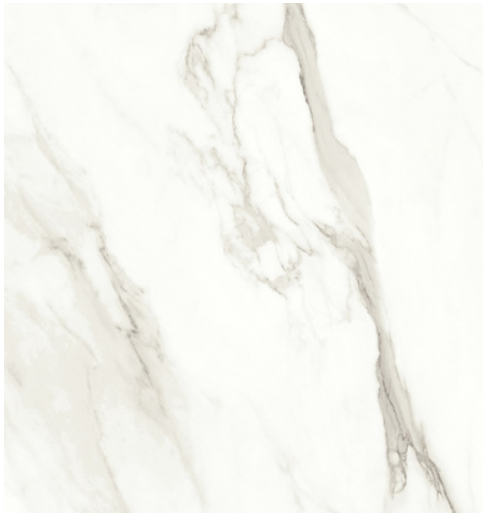
Prestige Linea Calacatta Polished

Prestige, an authentic force of nature, eternal in nobility and sophistication, is the true calling for modern Architecture.