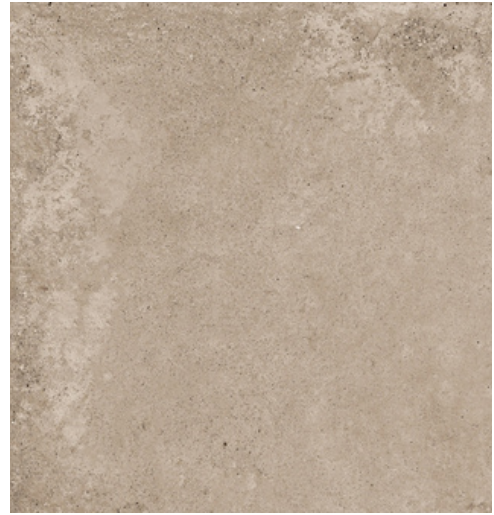
Evoke Beige Touch

NCS188620 600x600x9.5mm NCS188621 900x900x11mm NCS188622 600x1200x11mm