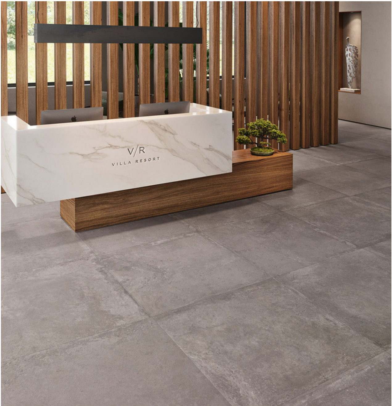
Evoke Grey Touch