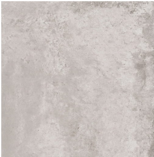
Evoke Light Grey Touch

NCS188623 600x600x9.5mm NCS188624 900x900x11mm NCS188625 600x1200x11mm