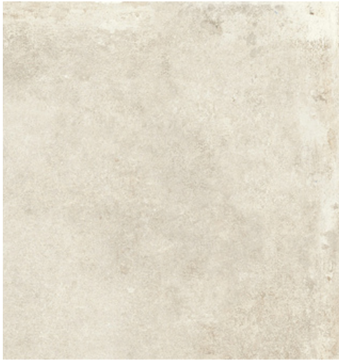
Evoke White Touch

Deeply inspired by the metropolis and urban reflections typical of the world's major cities, this collection bears resemblance to the typically urban lofts that seek to incorporate cement into the spaces and desires of avant-garde architecture.